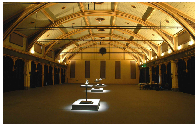
Figure 1: epi-thet at Arts House Meat Market, Melbourne January 2010

An alternative approach views the separation as a kind of liberation, creating a new opportunity for abstracted morphologies associated with sonic production. A related liberation has re-defined the long tradition of interdisciplinary engagement (as old as musical production itself) and given particular shape since the late twentieth century as digital data has been able to flow freely between artistic modes. More pertinently, Schafer's “schizophrenia” has enabled a greater participation in the unfolding of creative